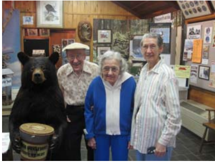
The Colony Trip to Linesville, PA