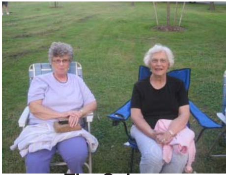
The Colony Concert at Buhl Park