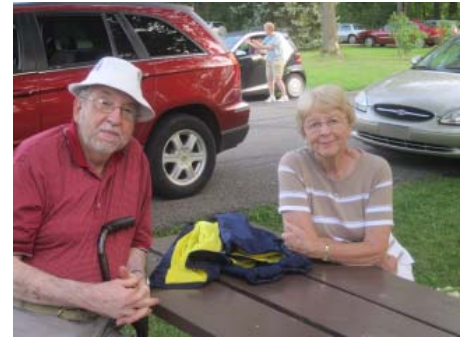
The Colony Autumn Breakfast