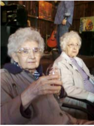
The Villas Visit to Lago Winery