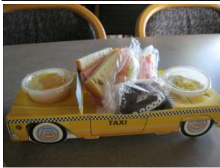
The Ridgewood Missed the Bus Buffet