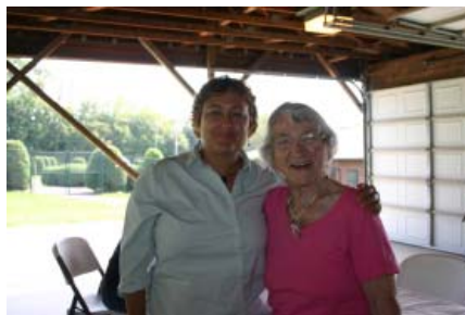
The Colony Ice Cream Social