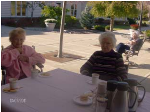
The Meadows Tea Party