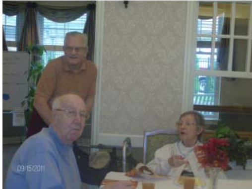
The Meadows Fall Party