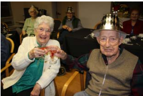
The Ridgewood Happy New Year!