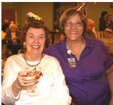
The Villas Happy New Year!